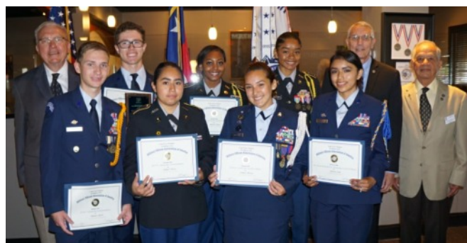
Last year's scholarship recipients.

The Meinhardt and Dadek Scholarships and the other chapter scholarships will be presented. The recipients' parents, ROTC cadre, and their school administrators will